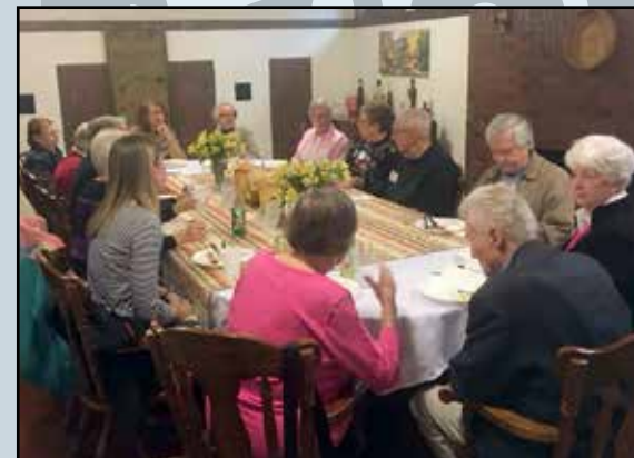
Sharing a meal of thanksgiving at the Provincial House.

Each and every one of our readers and friends, benefactors and alums truly mean the world to us. It is through your fervent prayers and support that the Society is sustained and given hope for our current and future ministries. More than 80 individuals were able to join us for an evening of gratitude that filled the USA Provincial House in Milwaukee, WI in May. We remain grateful and humbled by the ongoing interest and faithful support from each of you.