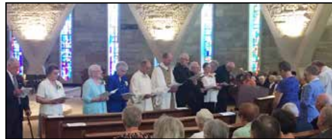
Celebrating Jubilarian anniversaries for 14 members of our Salvatorian Family.