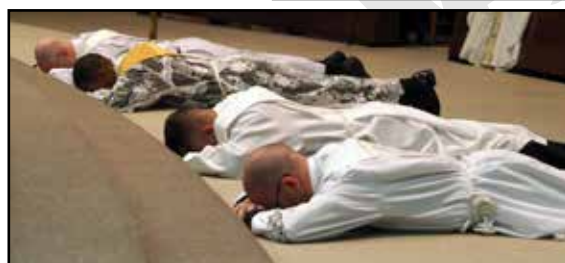
Laying Prostrate during the Litany of the Saints.