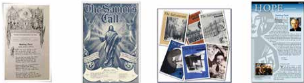
Photo progression of publications | Manna – The Saviors Call – The Salvatorian – Hope

of our founder, Fr. Francis Jordan, “to proclaim the goodness and kindness of the Savior by all ways and means possible.” Evolutions for the Hope newsletter have been happening for decades as we acclimate to be apostles for our times. Today we share the latest adaption.