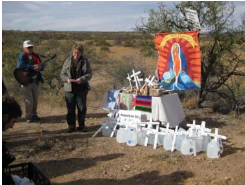
The desert shrine created by No More Deaths and Samaritans to remember fallen migrants.

No More Deaths is an organization whose mission is to end death and suffering on the U.S./Mexico border through civil initiative: the conviction that people of conscience must work openly and in community to uphold fundamental human rights.