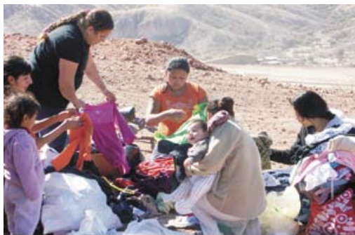
Donations make their way to help the people at the Nogales Dump, the Rehab Centers and other centers listed on this page.

Our shared Value of Prayer is demonstrated by the Deacons from the Diocese of Tucson who work to make the lives of these unfortunates better. SMA regularly provides personal care items, vitamins, dietary supplements and First Aid supplies to Poverty 24/6.