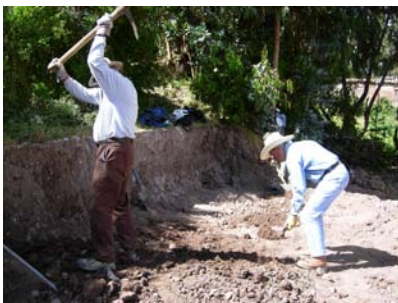
From the ground up, SMA participants began the work on the greenhouse