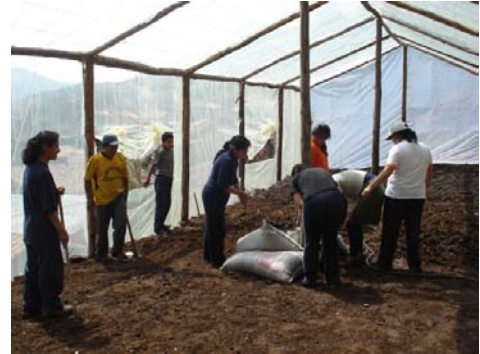
One of the recently sent pictures shows the fruits of our labor

In order to bring the much needed medical supplies to Peru, we enlisted donations of large suitcases. We filled them to capacity!